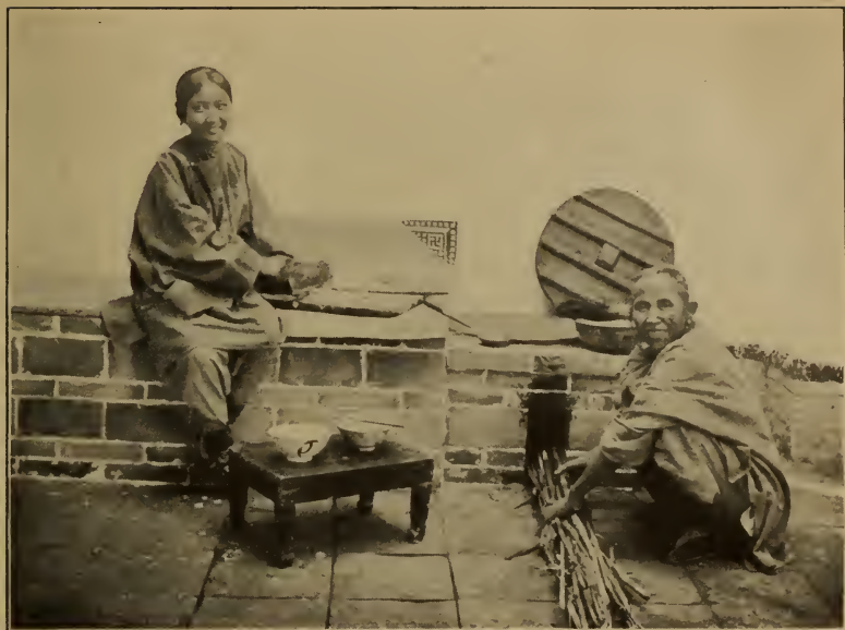
WOMEN PREPARING FOOD.